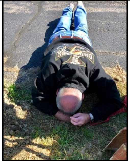
The Recorder has been looking for the Treasure high and low and has finally found him.

As you can see on the front cover we are having the fish fry's again. Plan on joining us, all proceeds are to support Kaaba the Fraternity. Pass the word !!!!! Tell your friends & neighbors to join us.