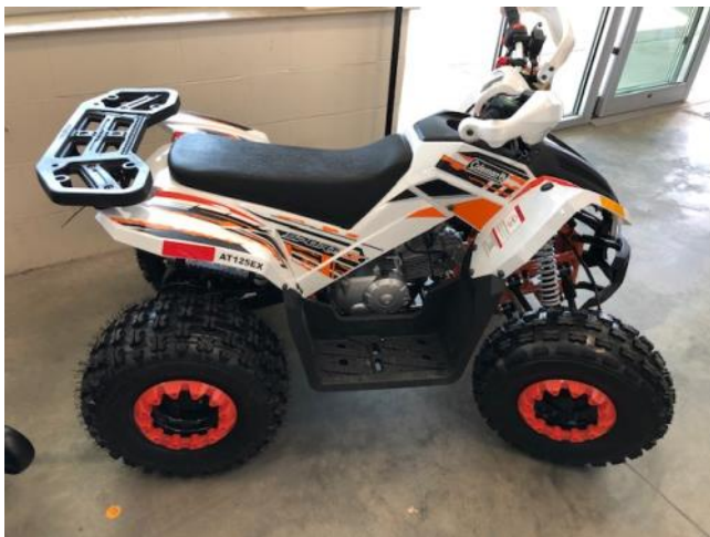
Will be the first Raffle ticket drawn