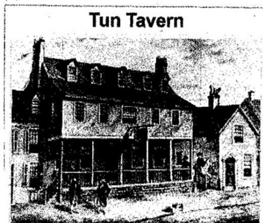
Sketch of the original Tun Tavern