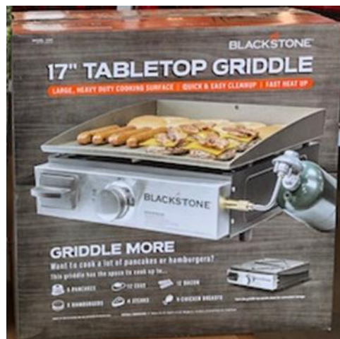
SILENT AUCTION ITEM