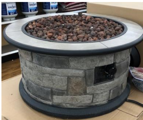
SILENT AUCTION ITEM