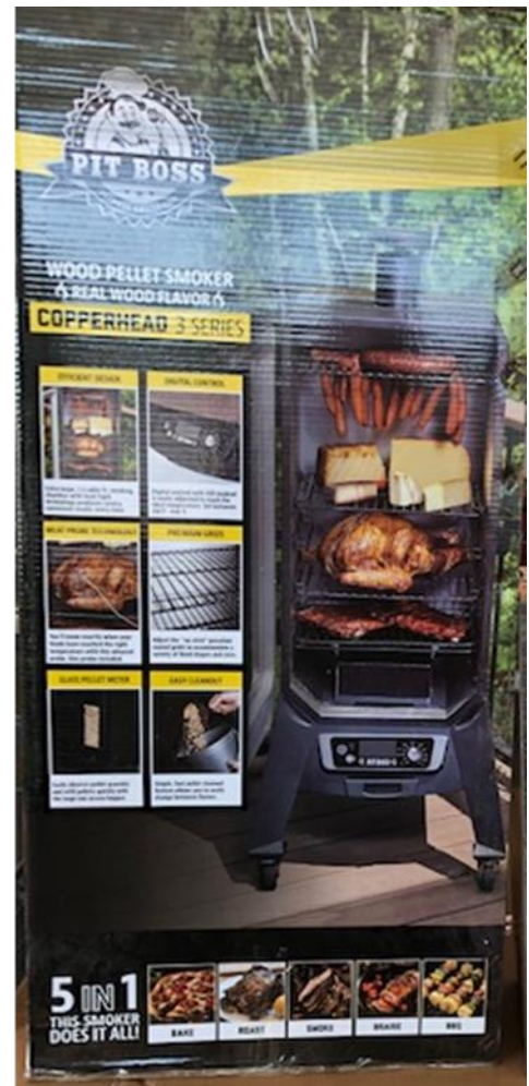
SILENT AUCTION ITEM