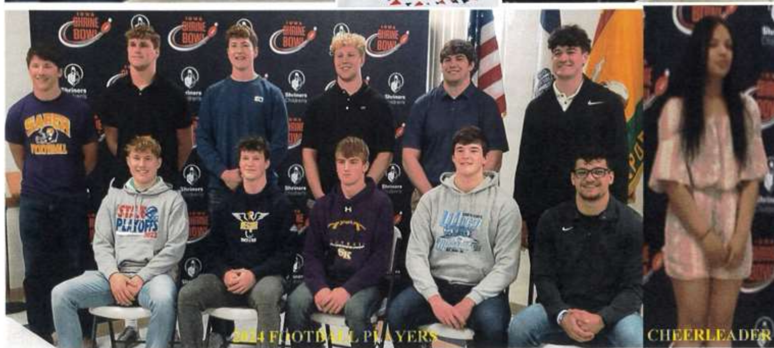
2024 FOOTBALL PLAYERS