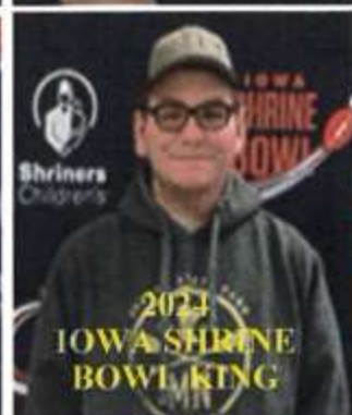
2023 IOWA SHRINE BOWL KING