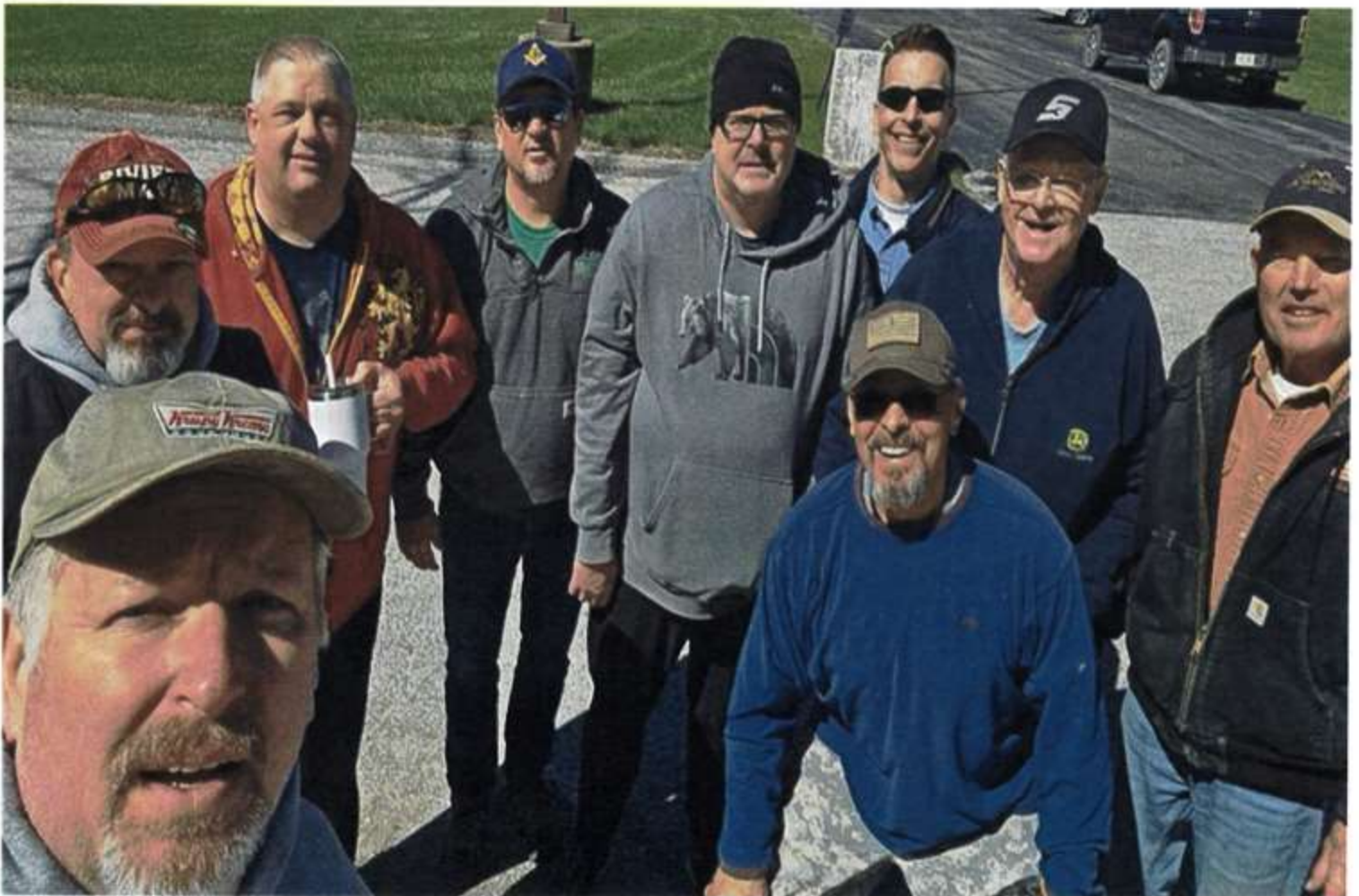
Team Kaaba Members

We are grateful to everyone who has donated tabs, and we hope all will continue sending tabs to us!