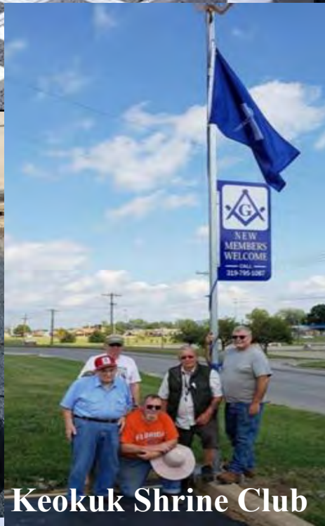
Keokuk Shrine Club