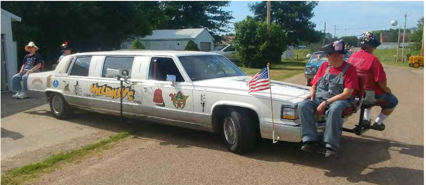
KAABA HILLIBILLYS PARADE UNIT